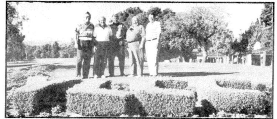
PADRE XIII Committee members look over Yorba Linda's "greens."

A great dinner will be held following the golf and tennis tournament (more information on page four - back page).